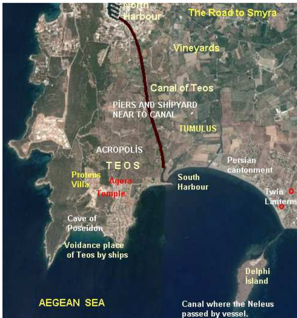
Plan of the TEOS